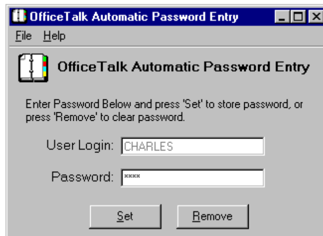
OfficeTalk Automatic Password Entry dialog box